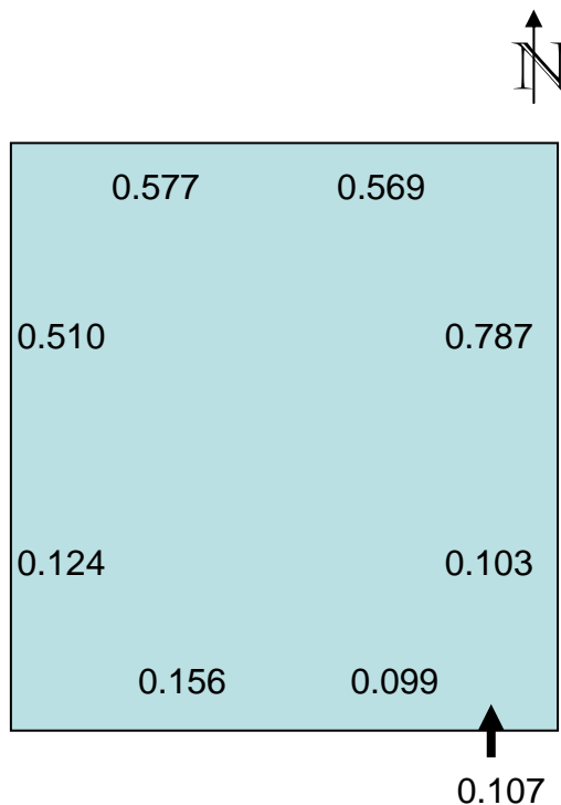
Figure 1. Phosphate (mg/L) in rice field water, 48 hours after water started entering the field.

The combined results of an algal growth experiment (that showed the levels of phosphate that limited growth of Nostoc spongiaeforme ), the measurements of phosphate levels in initial rice field water samples, and the data showing that phosphate levels in rice field water increased in a field where the phosphorus fertilizer was surface applied but not incorporated, provide strong evidence to support the notion that incorporating phosphorus fertilizer would lead to reduced phosphate levels in rice field water and subsequent reduced growth of algae, especially the so-called "black algae," Nostoc spongiaeforme .