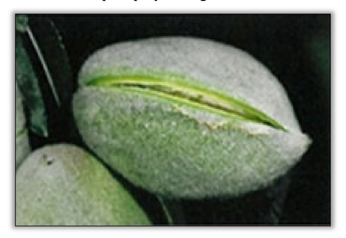
Stage 2C of hull split. This is the critical time for NOW insecticide and Rhizopus hull rot fungicide applications. The orchard is ready for harvest when all nuts are at Stage 2C.

• Navel Orangeworm (NOW) & Peach Twig Borer (PTB): Continue monitoring for NOW and PTB to determine when and how to manage these pests in your orchard. Given the high levels of NOW damage we saw last year, and the challenge many growers had in sanitizing orchards over the winter, this is a year to pay special attention to your NOW management. Consider an edge spray when the first sound nuts in the upper canopy of border trees reach hull split Stage 2C (see photo), and a full spray once nuts in the upper canopy of trees within the orchard reach that same stage. Consult with your PCA when making decisions about NOW and PTB management. Switch insecticide chemistries between generations. See the article in this newsletter for more information on hull split spray timing.