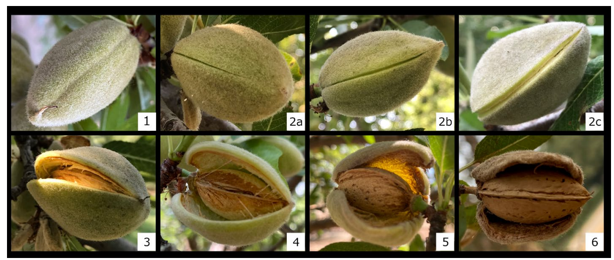
Figure 1. Almond hull split stages

Almonds can be harvested as early as when 100% of the nuts on the tree reach hull split. 100% hull split occurs when the lowest nuts in the lower interior canopy reach stage 2C (Figure 1): there is a deep V at the suture and the nut splits open when hand pressure is applied to opposite ends of the hull. Historically, the recommendation from UC almond experts for the ideal time to shake was as soon as 100% hull split occurred, keeping in mind pest and disease management, nut removal/drying time, and nut quality. However, these considerations vary widely among varieties and locations, so we'd like to address potential challenges that growers should consider when timing harvest, with additional notes on this year's specific challenges.