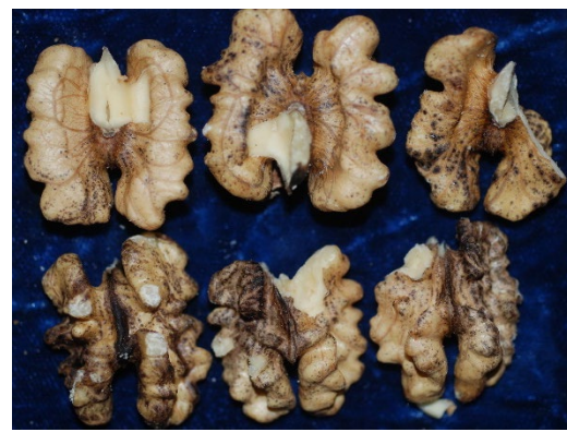
Photo 1. In the past five to six years there have been increased reports of walnut mold. Right photo: stained regions on the kernel are covered by loose mold mycelia.