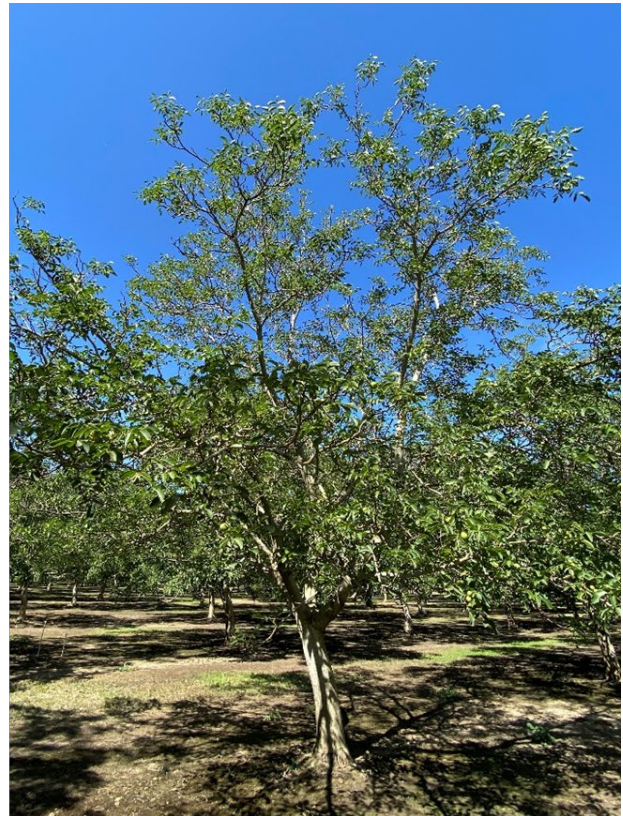
Photo 1 (L) and Photo 2 (R). Photo 1 (L) of a 9 th leaf Howard orchard in Butte County shows the clear dieback, particularly higher in the canopy, that we typically associate with freeze damage symptoms (6/3/2021, photo by Luke Milliron). Photo 2 (R) shows a very thin canopy on June 10, 2020 in this Glenn County 15 th leaf Chandler orchard is also likely due to freeze damage, specifically due to delayed budbreak (6/10/2021, photo by Luke Milliron).