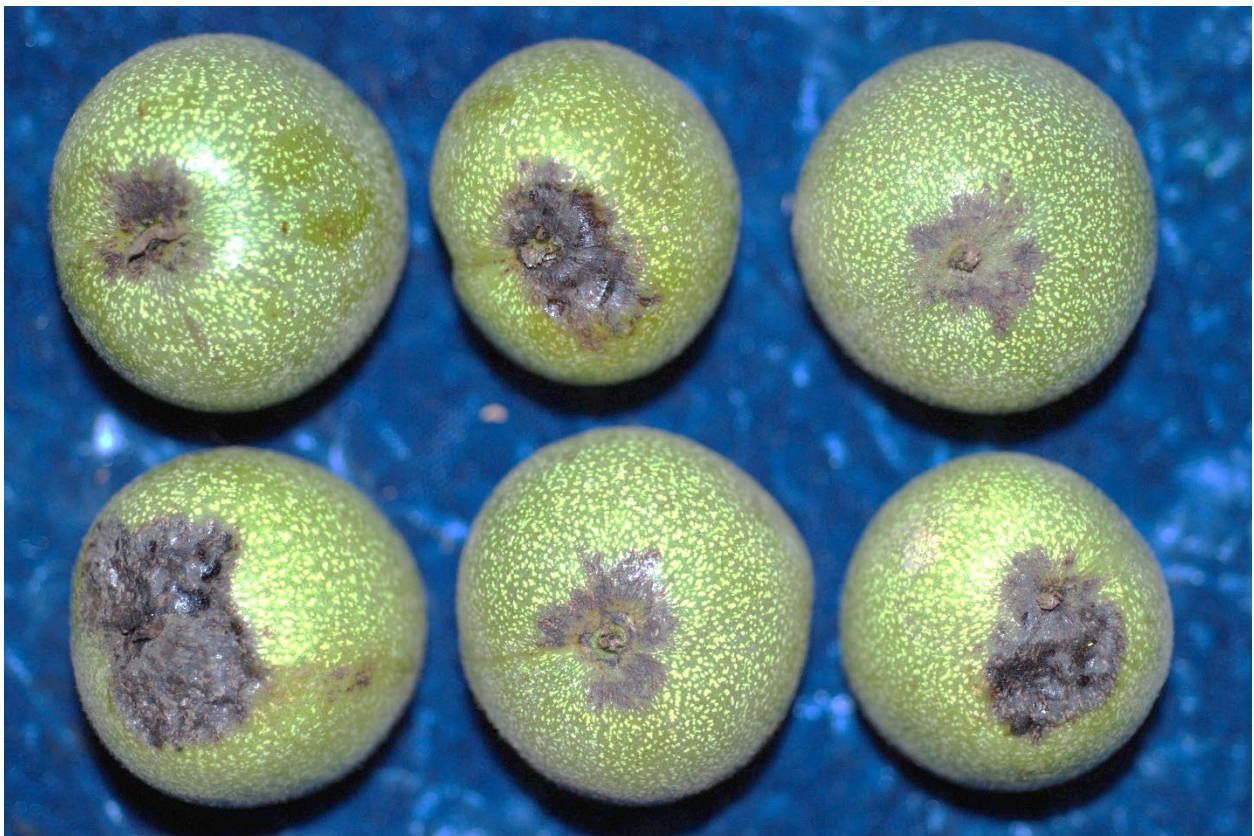
Photo 2. Brown Apical Necrosis (BAN) mold infections in Ivanhoe.

Secondary walnut blight ( Xanthomonas arboricola pv. juglandis ) infections that do not penetrate to the kernel nor result in nut drop, can create an entry for not only moth pests, but for the mold causing Fusarium and Alternaria species. These infections are a specific type of walnut mold called brown apical necrosis (BAN), named because the black blighted lesions at the apical end (aka: stylar – floral remnant) of the fruit, that turn brown following fungal colonization (Photo 2). As the fungal infection expands under the hull, the hull is decayed and the infection spreads to the kernel, most likely through the apical end. It stands to reason that improved walnut blight management, particularly of secondary infections, will lead to less BAN although this has not yet been studied. More on walnut blight best management practices at: sacvalleyorchards.com/walnuts/diseases/walnut-blight-management/