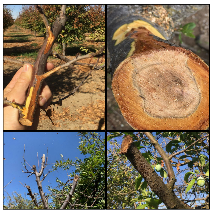
Upper left: Cytospora canker – clear canker margin and evidence of devastation in the background. Upper right: Cytospora canker in a major scaffold – clear evidence of the canker continuing beyond the cut (dark brown – dead bark on the outside of the cut surface, with the canker continuing down the scaffold). Lower left: Photo of newly dead (2022 season) branches - infected at mechanical pruning cuts - photo taken during 2022 harvest. Lower right: The bumps below this mechanical cut indicate that the bark has been killed and has now become a spore source (the bumps are pycnidia hich will release fungal spores that can infect new trees during the next storm event).

When: Thursday Sep 29, 2022 9:00-10:30 AM. Register in advance for this webinar! After registering, you will receive a confirmation email containing information about joining the webinar. For folks who can't attend or want to watch it back - this webinar will be recorded.