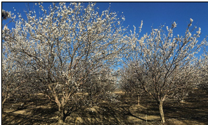
Figure 3. Rootstocks Nickels, a peach-almond hybrid, alongside Lovell, a pure peach, both with cv. Nonpareil as scion.

Rootstocks with plum heritage often have good anchorage to withstand heavy winds. A trial in Kern County found the complex hybrid Viking had only 4% blow-overs following an 85 mph sustained wind coupled with rain. It's complex hybrid sibling, Atlas had 30% blow-overs. Other trials and anecdotal evidence have shown the plum hybrid Krymsk 86 and the peach-almond hybrids F x A and Hansen 536 to have excellent anchorage as well. Plum hybrids are generally considered to be the most tolerant to winter waterlogging, though it should be noted that wet soil in-season can worsen incompatibility symptoms we sometimes see with certain cultivars and plum heritage rootstocks.