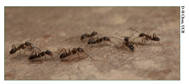
Argentine ants trailing on pavement.

Although ants are annoying when they come indoors, they can be beneficial by feeding on fleas, termites, and other pests in the garden.