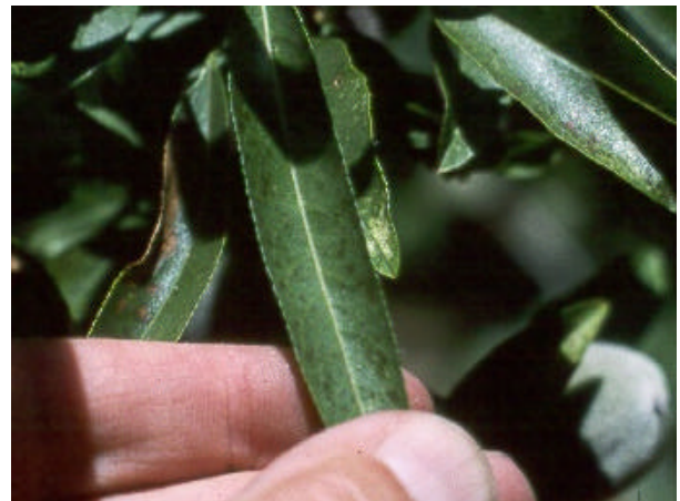
Bronze spots—early summer before leaves burn

Diagnosis is also hampered by mite size, which is extremely small, about the size of a single leg of a 2-spot mite. You need at least a 15x hand lens to see them on the undersides of succulent leaves. (See photo above)