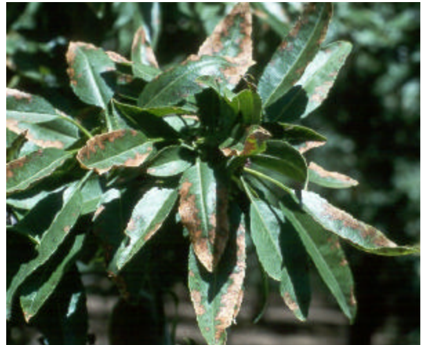
Leaf burn from mite feeding