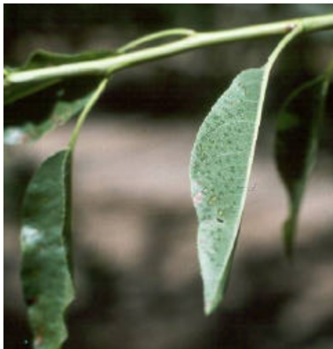
Spring symptoms—darkened water spots