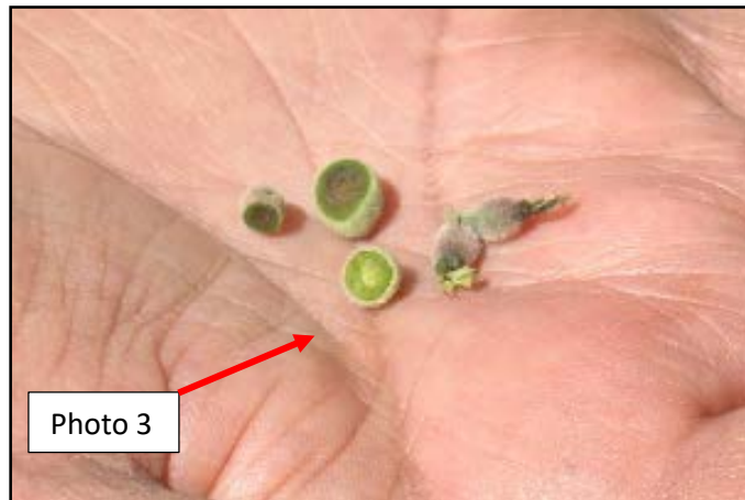
Frost damaged walnut flowers and nutlets. The green nutlet in center (see red arrow) is undamaged.