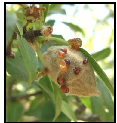
Bacterial spot on almond nut.

Almond symptoms develop on leaves and shoots, but the most obvious symptoms are on fruit. Typically, almond hull lesions start as small, watery blemishes that produce light to dark amber gumming. Lesions are brown and slowly increase in size to 2/32 to 5/32 inches (2 to 4 mm, generally <5 mm) in diameter during the season as the infection extends into the hull. The amber color of the gumming is important because this helps distinguish bacterial spot from the clear gum of leaf footed bug feeding injury. Infections starting early in the season can cause fruit drop and infections that reach the kernel may cause off grades, or fruit may be un-marketable. Symptoms are usually first visible 7 to 21 days after infection with rapid expression dependent on warm temperatures. Small angular lesions may develop on leaves at the leaf tip, mid-rib, or along the leaf margin. Infected leaves may prematurely drop. As lesions age, centers may darken, become necrotic, and they may abscise. Leaves are most susceptible before becoming fully expanded. Twig lesions may develop on green shoots. These lesions are not obvious on almond but have